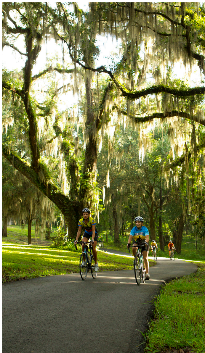
J. Lee Vause Park

The expected hiring range is $160,000 to $190,000 dependent upon qualifications and will include a competitive benefits package. The County will pay reasonable relocation expenses.