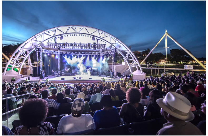
Capital City Amphitheater

The County has a population of 287,899 and encompasses approximately 700 square miles. The City of Tallahassee, population 190,000, is the County seat, Florida’s state capital, and the only incorporated city within the County. The City of Tallahassee covers about 100 square miles, and roughly 34 percent of Leon County residents live outside the Tallahassee city limits.