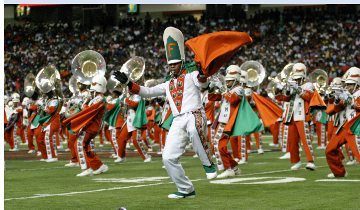
Florida A&M University Marching 100

Leon County Government is an Equal Opportunity Employer. Pursuant to Florida's broad Public Records/Sunshine Law, applications and résumés are subject to public disclosure.