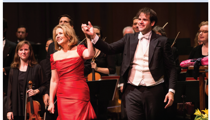
Tallahassee Symphony Orchestra