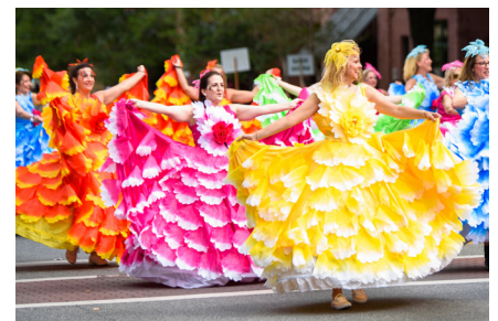
Springtime Tallahassee Festival

The area offers exceptional local dining, theaters, nightlife, shopping venues, museums, and an abundance of recreational activities. With an average of 233 days of sunshine each year, Leon County has long summers and short mild winters, ideal for the outdoor enthusiast. The region has many natural wildlife habitats to enjoy, as well as freshwater springs, beaches within a one-hour drive and nearby hunting and fishing. The County is home to more than 78 miles of canopy roads where the limbs of moss-draped live oaks, sweet gums, hickory trees and pines provide a towering canopy over roads that were once paths traveled by native tribes. The warm climate, ethnic diversity, natural beauty, stable economy, a variety of housing choices, excellent schools, and advanced transportation system afford residents an exceptional quality of life.