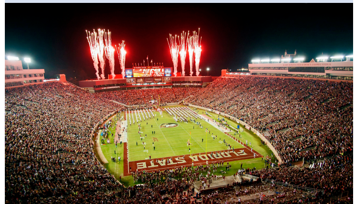
Florida State University